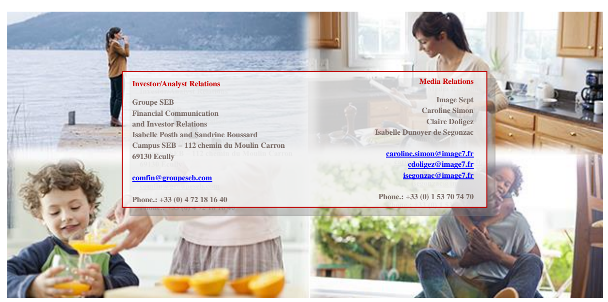
Find us on www.groupeseb.com